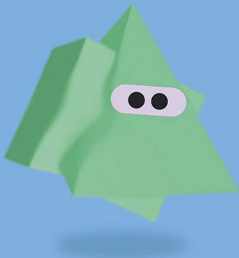
Build and Mold