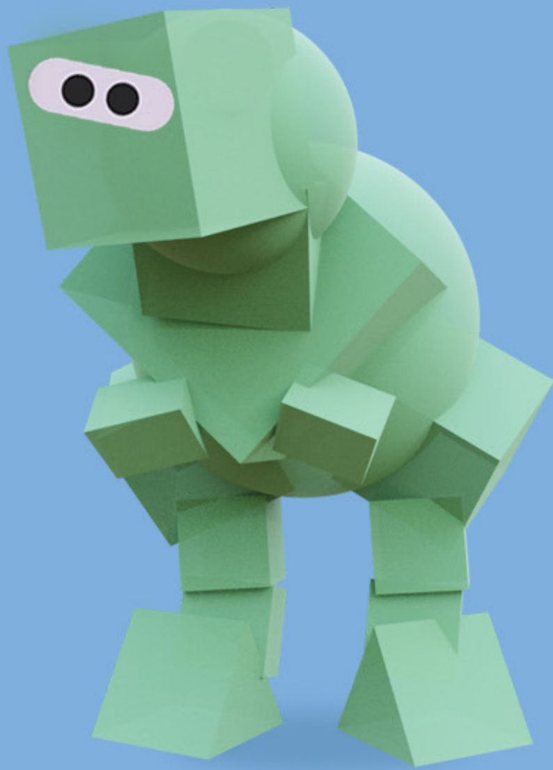
Watch it come to life!